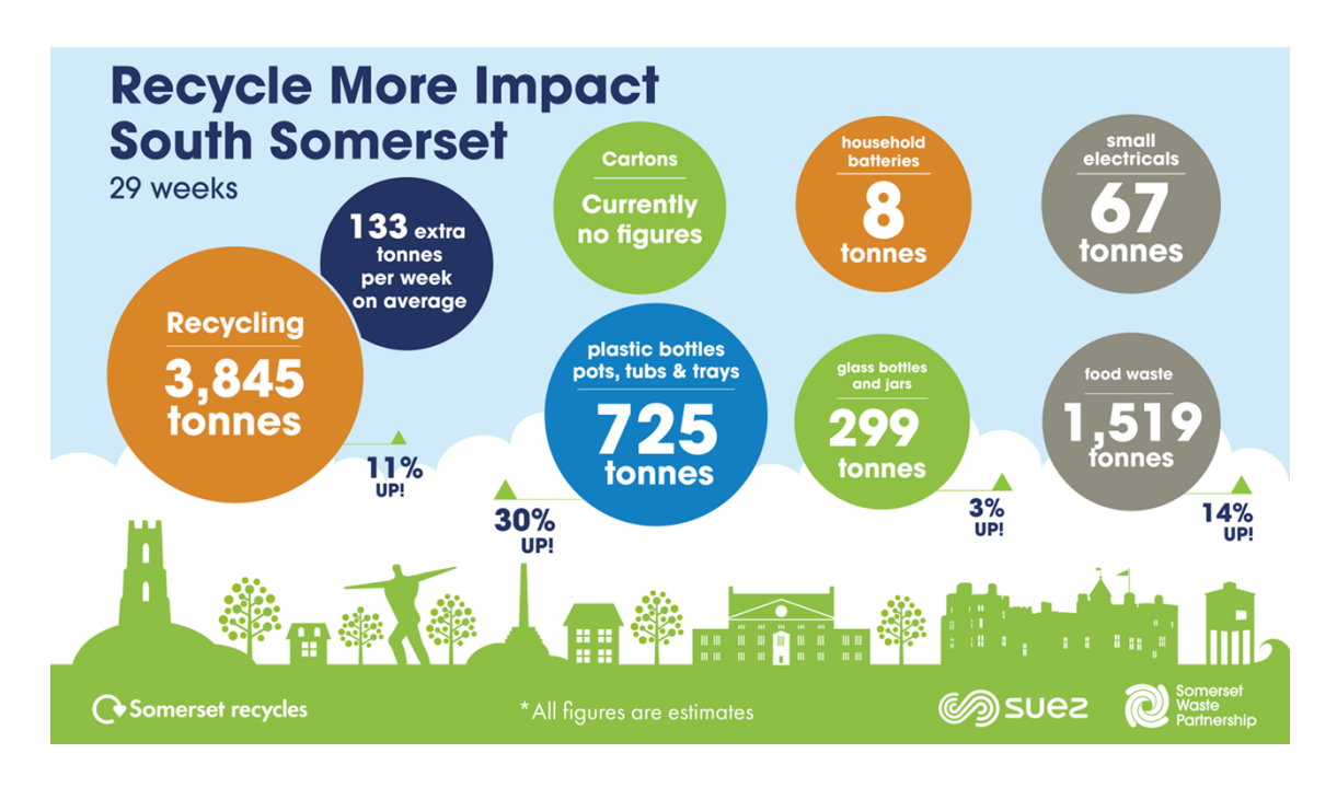
Figure 2: Recycle More 29-week tonnage for South Somerset